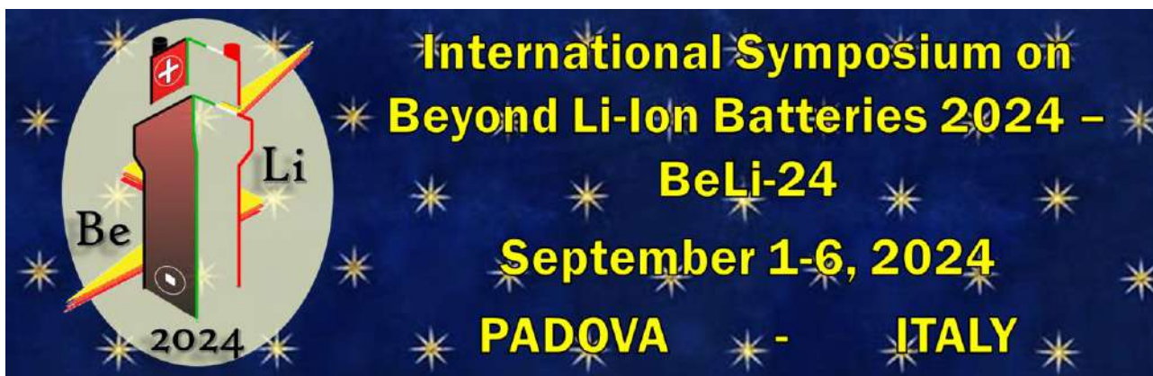
Exhibit and Sponsorship Opportunities